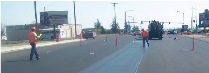
The higher strength at low strain of GlasPave Paving Mats extends pavement life by delaying reflective cracking.

The high performance hybrid fiberglass structure of the GlasPave® Paving Mats provides significantly greater tensile strength at low strain compared to conventional paving fabrics and other paving mats. The higher strength at low strain helps extend pavement life by delaying reflective cracking, which is a common contributor to costly repairs and the eventual failure of asphalt overlay applications.