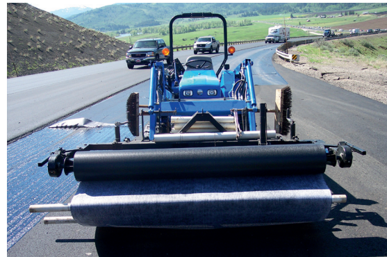
GlasPave is easy to install using conventional equipment.

With roll lengths ranging from 75 yds to 120 yds, GlasPave Paving Mats install light side down on a level up course with fewer roll changes when compared with bulkier products with shorter roll lengths. GlasPave Paving Mats are also available in two roll widths (6.25 and 12.50 ft), which make for easier placement around corners and curves, while maximizing layout efficiency.