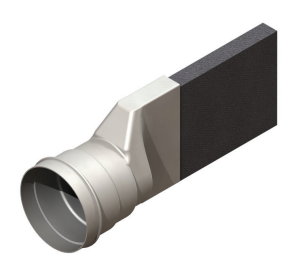
6" End Outlet 10/box