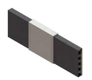
6" Splice Connector 10/box